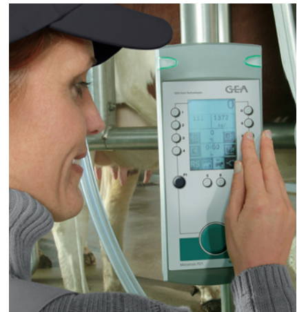
Management on the spot: Metatron P21 - "the small PC in the milking parlour"

Milking is enjoyable in this clear, easy-to-maintain environment. The milking technology that is integrated in MultiLine is protected from dust and moisture. There are two handles that enable the MultiLine cover to be opened easily to carry out maintenance. MultiLine helps to keep the noise level down in the milking parlour for operators and cows.