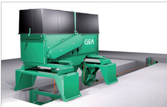
■ SWS-300 and SWS-300 HD - Cable drive units on stands equipped with one or two wheels.