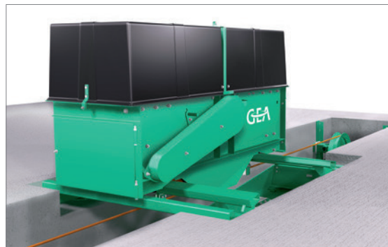
■ SWR-300 and SWR-300 HD - Cable drive units installed in a recess.