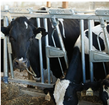
Cow friendly design.

Latch mounted on the frame for long life.