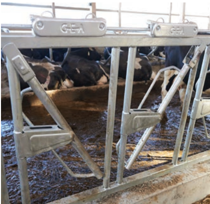
Swing arm support.

efficiency of safely handling cattle, while creating less stress on the animals. They also improve the efficiency of day-to-day operations such as breeding, vaccination, and many other herd management tasks.