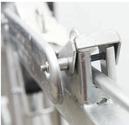
Positive locking system.

“Lock up” position — positively locks cows in place.